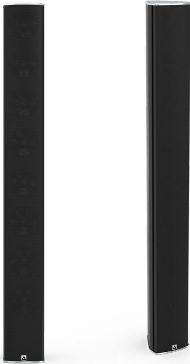
Illustration in colour option, see mechanical properties